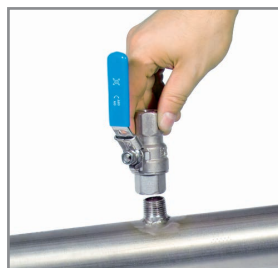
A Screw neck

Drill holes can be drilled through the 1/2" ball valve into the existing tubing with the help of the drilling device, the drill chips are collected in a filter, then the probe is installed as described under 1).