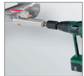
Drill under pressure with the CS Drill

3) Due to the large measuring range of the probe even extreme requirements to the flow measurement (high volume flow in small pipe diameters) can be met.