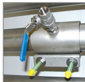
B Spot drilling collar